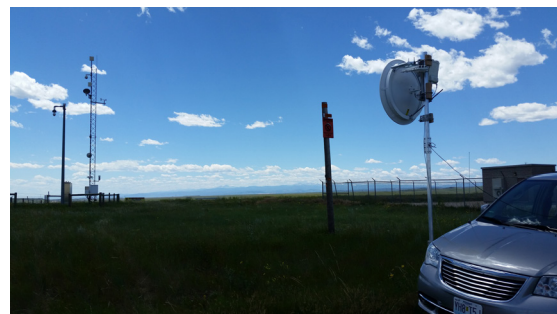
PTP Module at Cheyenne