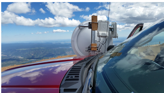
PTP Module at Pike's Peak

THE ENGINEERS MET IN DENVER TO STAGE THE EQUIPMENT AND SEPARATED INTO TWO TEAMS - ONE TO PIKE’S Peak and one to Cheyenne. Installation was completed in less than an hour. “At the top of Pike’s Peak, we parked and started setting up the temporary mounts and other equipment. With limited mobile cellular communications at the summit, it was amazing when we connected the PTP 650 link and could communicate with clear voice and video directly with the remote team utilizing our VoIP gateway,” said Collins.