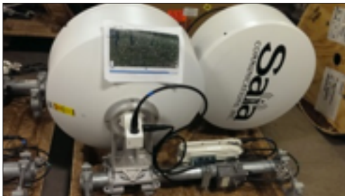
Equipment staged at Saia Communications facility

Once all of the links are established they will be integrated into the County’s Wireless Manager system to monitor performance in real time and assist in maintenance and troubleshooting.